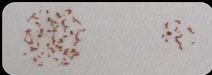
Captured from EXL device